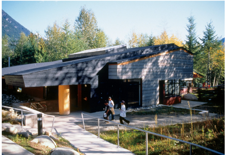
BUILT IN 1999, PQÚSNALCW is in need of repairs and updating. Shown here prior to opening, the building was recognized with a 2000 Lieutenant Governor of British Columbia Award for architecture.

The focus of the work at Pqúsnalcw (Eagle’s Nest) will be on the building envelope, specifically the roof, heating and ventilation systems to increase energy efficiency. As well, the kitchen will be enhanced to accommodate greater community food preservation and tie-in with Lílwat Nation’s agricultural program. A commercial food dehydrator and vacuum sealer, convection ovens, fridges and freezers, are among the upgrades the kitchen will receive.