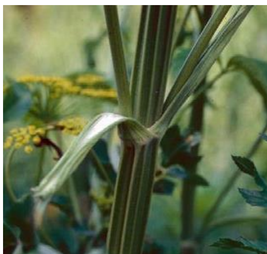
The stem is light green and deeply grooved.