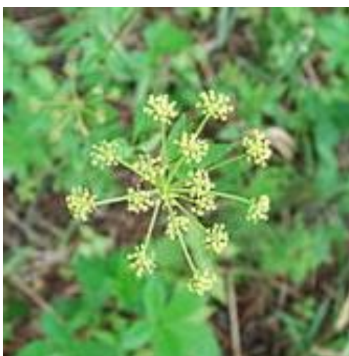
Yellow flowers form flat umbrella shaped clusters.