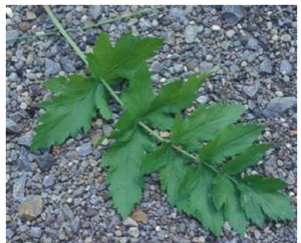
Leaves have distinct saw-toothed edges.

If you suspect you have Wild Parsnip growing on your property, do not try to remove it yourself without proper training and protective gear. Please contact the Lands and Resources Department at 604-894-6115 or report to the SSISC at ssisc.ca/report .