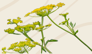
Yellow flowers form flat umbrella shaped clusters.