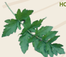
Leaves have distinct saw-toothed edges.